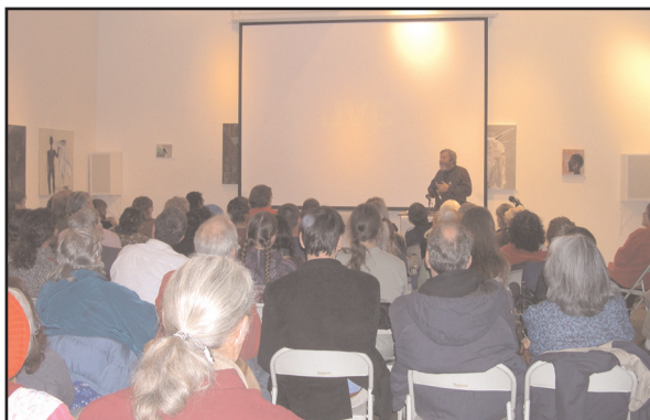
Audience listens to the Food Not Bombs presentation in Taos, New Mexico.

Hunger • Globalization • Poverty • Peace Nonviolent Social Change Community Organizing • Alternative Media Activism • Human Rights